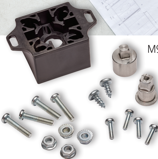
M9000-700 Universal Ball Valve Linkage Kit