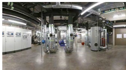
Control surface, wiring and control panels of the new High Performance Computing Centre.