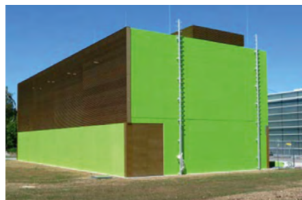
New technical building with transformer station, four cooling towers and building automation facility.